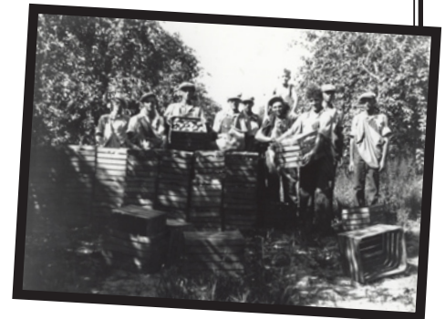
Harvest time at Crane's