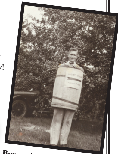
Bumpa (Grandpa) in a barrel.