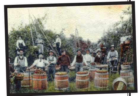
Harvest time in Michigan

(Check our freezer and take a quart home!)