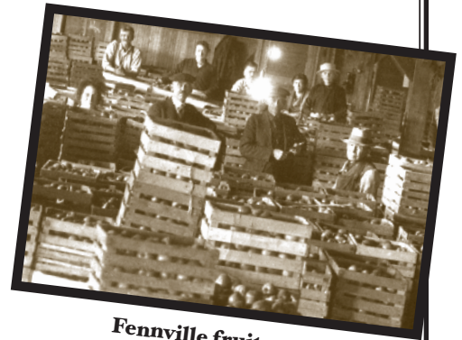
Fennville fruit exchange.

We make our pies here at the Pie Pantry, exactly as you would at home. The crusts are a special recipe perfected by Mrs. Crane - made with all vegetable shortening - rolled, crimped, and vented by hand. No preservatives, or colorings are used. All desserts served warm! Just the way grandma would want it.